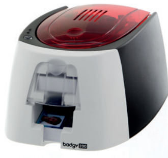
Badgy200 card printer