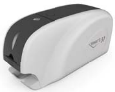
Single sided ID CARD PRINTER smart-31 S