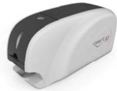
Rewritable ID CARD PRINTER smart-31 R