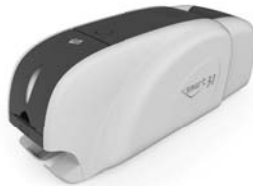
Dual sided ID CARD PRINTER smart-31 D